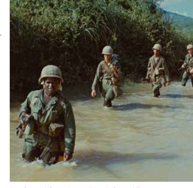
American soldiers advance through rice paddies, October 10-11, 1966.