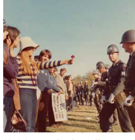
A female demonstrator offers a flower to military police on guard at the Pentagon, October 21, 1967.

During the beginning stages of the Vietnam War, few Americans saw a reason to question the government's assertion that the United States had vital interests 8,000 miles from home; nevertheless, a small and growing number of individuals opposed the war for a number of reasons. Some thought it unjust or immoral, believed it was unconstitutional, or simply thought that it was not in the national interest. Universities across the country began to hold teach-ins to open up communication between the people and the government. In spring 1965, the Students for a Democratic Society organized a demonstration at the White House, drawing 25,000 individuals who were part of the antiwar movement. (03m35s)